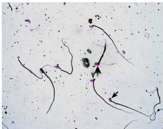
Fig 2: abnormal sperm (HA -Head abnormality) Eosin Y stain , 400x ➡➡➡ Showed Head abnormality