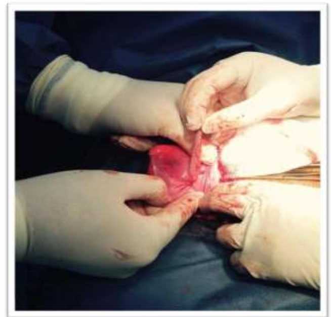
PIC- 2 -