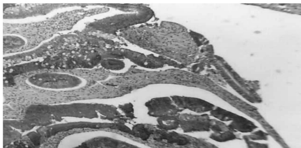
Figure 2: shows pancreatic adenocarcinoma glands positively stained with IHC method CA19-9/ X100