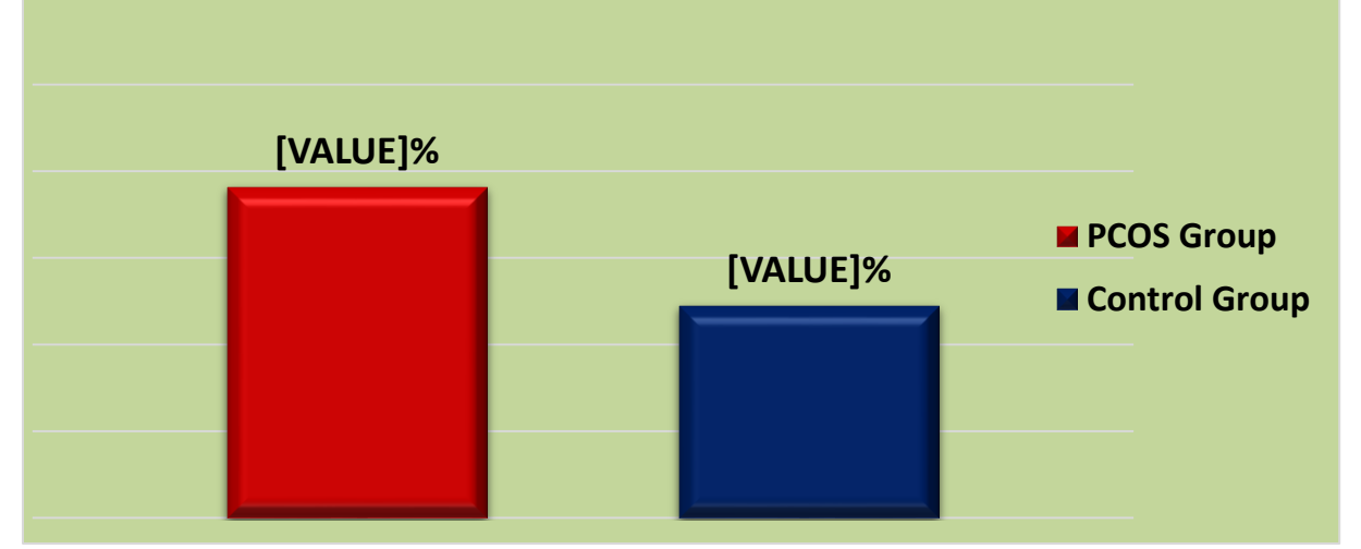
Figure 3: Distribution of study groups according to percentages of NRG-4

LH: luteinizing hormone; FSH: follicular stimulating hormone; Free testosterone, DHEAS: Dehydroepiandrosterone sulfate, NRG-4: Neuregulin-4