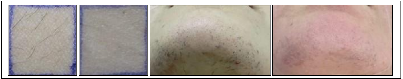
Figure 2: An example of treatment before the first session and after completing the last session

The response to IPL hair reduction is shown in (figure 3). The degree of hair elimination was evaluated using the GAIS score developed by the treating physician; the following categories were considered: Excellent 75%-100%, good 50%-75%, average 25%-50%, poor 0%-25% and no result 0% for hair reduction.