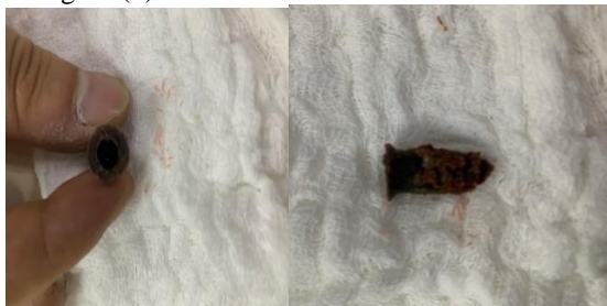
Figure (2) Plastic whistle removed after 15-years of inhalation.

passed with bowel motion. The removed FB was shown in Figure (2).