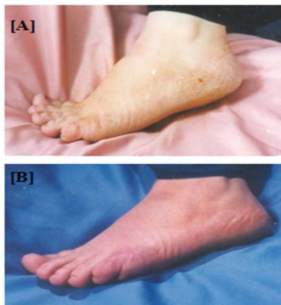
Figure 3- Photographs of the plantar psoriasis lesion [A] before treatment, and [B] after 3 months of treatment with black cumin oil ointment.

The present study recommends the use of 10% Black cumin oil ointment as a topical therapy for palmoplantar psoriasis, as it is a natural plant extract. In conclusion, 10% black cumin oil ointment is effective, safe, non-costly, and well-tolerated topical treatment for palmoplantar psoriasis.